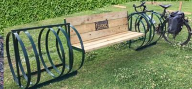
Bike Hub option 1